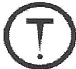
T = Toxic

D2B - Toxic materials, Eye irritation Class E : Corrosive to aluminum. Not corrosive to animal skin or carbon steel.