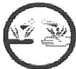
E = Corrosive